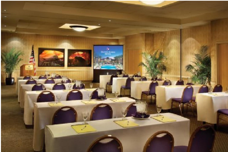
Even a small “classroom” set-up with no stage can work: screen off to one side and lectern off to another.

Please leave nothing to chance. If you still have questions about staging and A/V Requirements, please call Kevin as soon as possible to discuss. We are flexible and can accommodate you if not left to the last minute. We prefer no surprises with regard to staging and A/V.