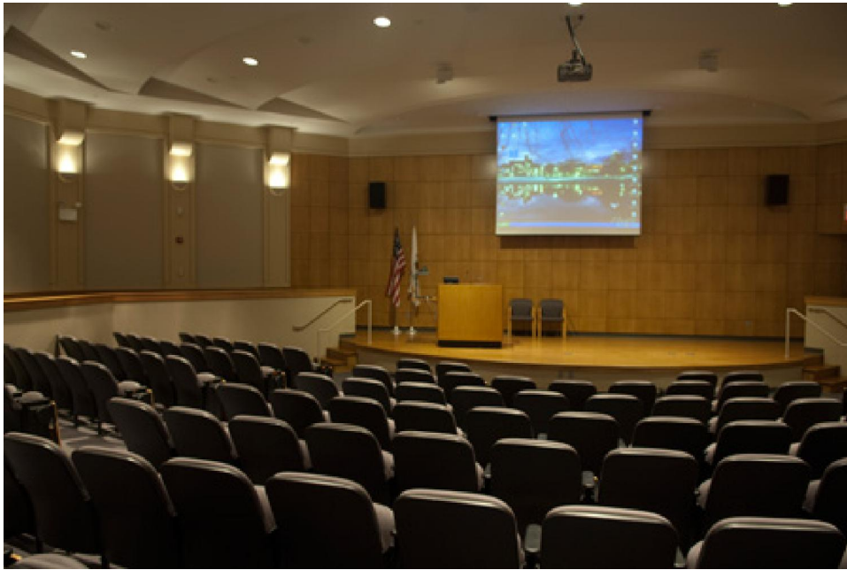
Stage with an overhead screen and ceiling-mount projector. Open stage with lectern stage-right.