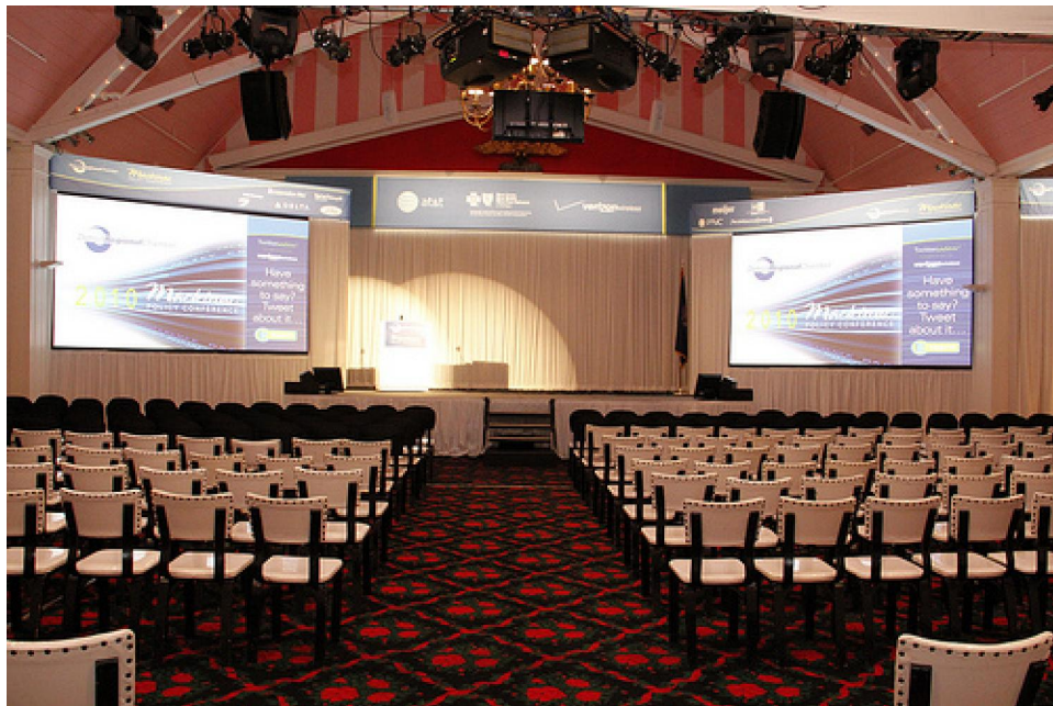
Screens on either side of stage with open stage – lectern located Stage-right.