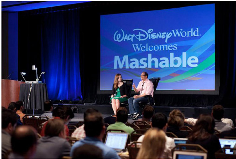
Rear-projected screen does not shine light in speaker's eyes. Lectern stage-right.