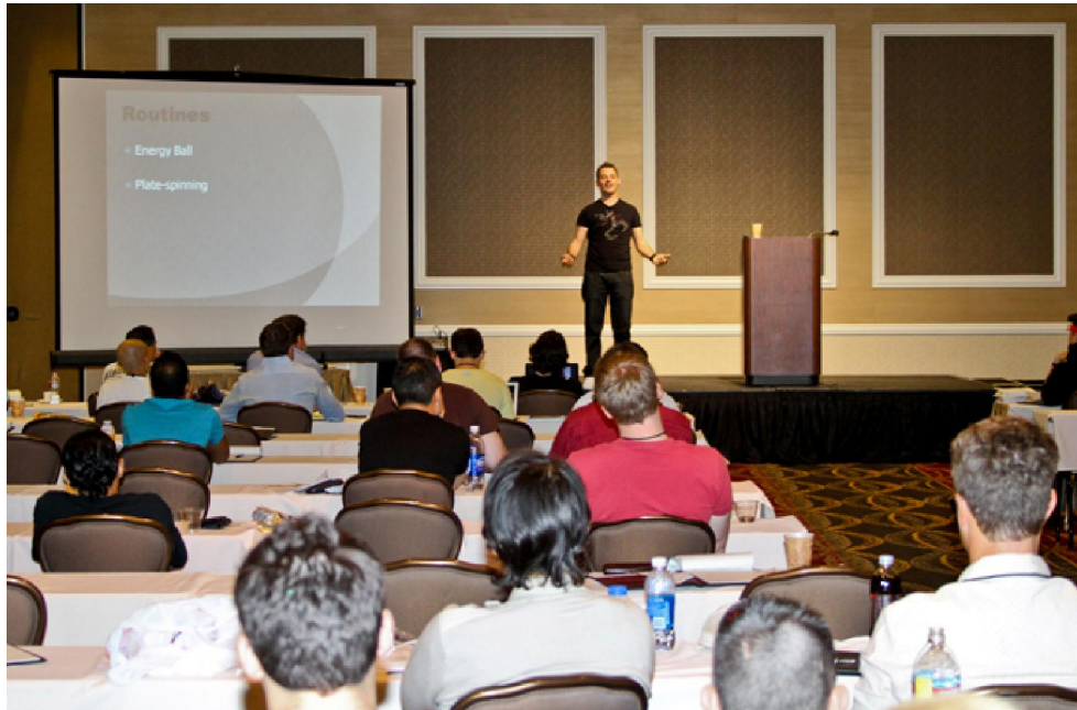
Raised platform with single screen off to side and lectern located off to side leaving stage open.